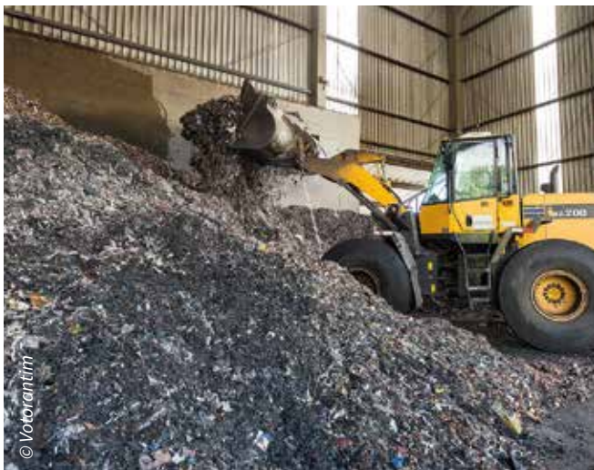
Top: co-processing of waste-derived fuel at Votorantim Cimentos Rio Branco do Sul plant in Brazil. Right: co-processing of açai seeds at the Primavera cement plant, Brazil

We have been tirelessly working to help decarbonise the entire value chain and leave a positive legacy for society as a whole, seeking partnerships, supporting the circular economy and developing new technologies. The SDG 17 (Partnerships for the goals) is one of the most important UN Sustainable Development Goals, since it supports the strengthening of means of implementation and global partnership for sustainable development.