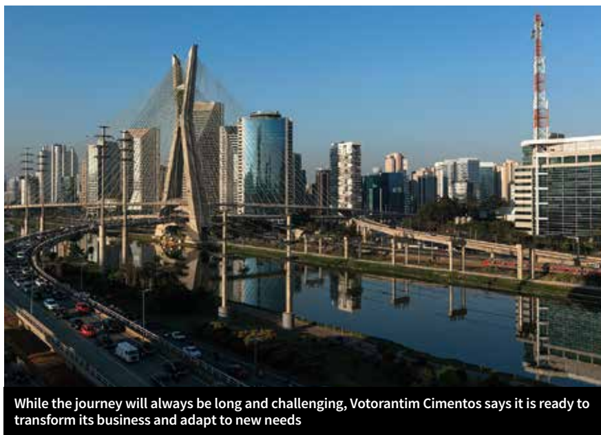
While the journey will always be long and challenging, Votorantim Cimentos says it is ready to transform its business and adapt to new needs

Our business strategy aims to increase our competitiveness and operational efficiency, while leveraging decarbonisation initiatives in all regions where we operate. Our biggest commitment – what moves us forward every day – is to make our company more sustainable, both in the long and short term. We know that the journey will always be long and challenging, but we are ready to transform our business and adapt to new needs, while honouring our past, living in the present and focussing on the future we want to build. ■